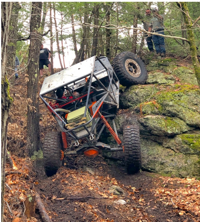
(Zach from Rockoholics attempting Sluice Box)