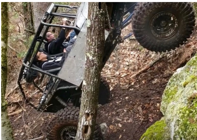
(Almost went backwards)

After going around Sluice Box, we ended up continuing to climb up through the woods. We got to an opening, overlooking some of the most scenic views Hemond's has to offer. We all parked up on the top, took a break, let some vehicles cool down, and took lots of photos, overlooking the ledge.