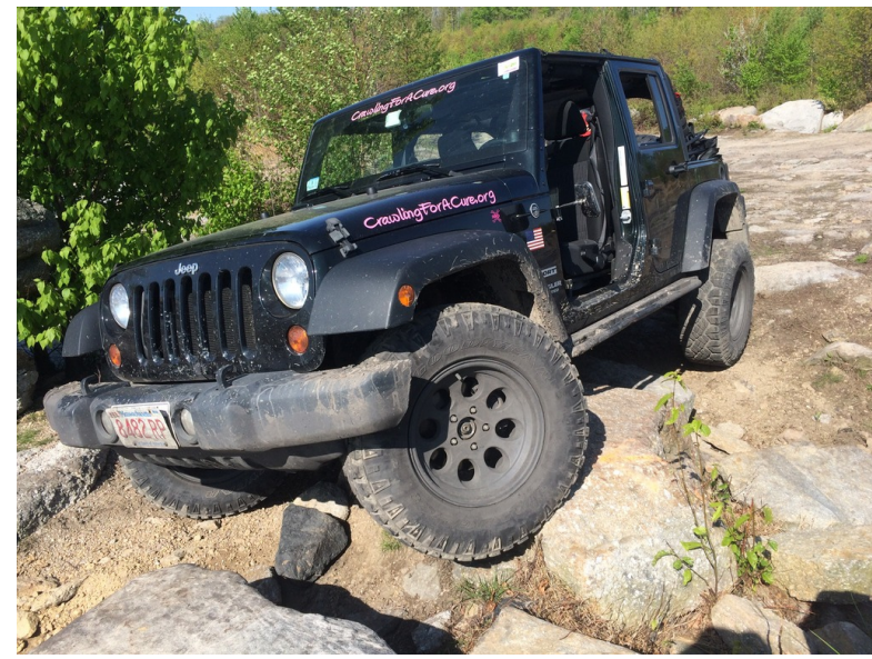
Check out more Rausch Creek pics and stories pics @ Baystate Jeepers Forum