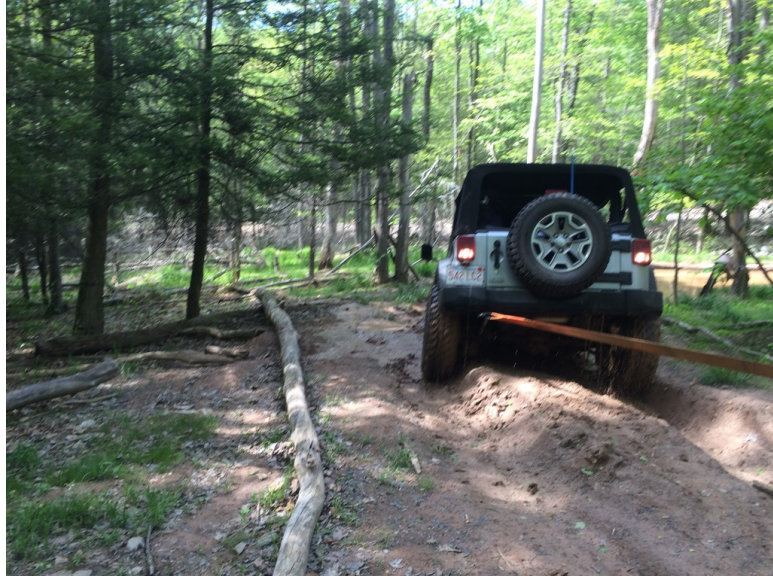
We also crossed paths with the BIG DWAGS, who were busy cracking their frames on the black and red trails