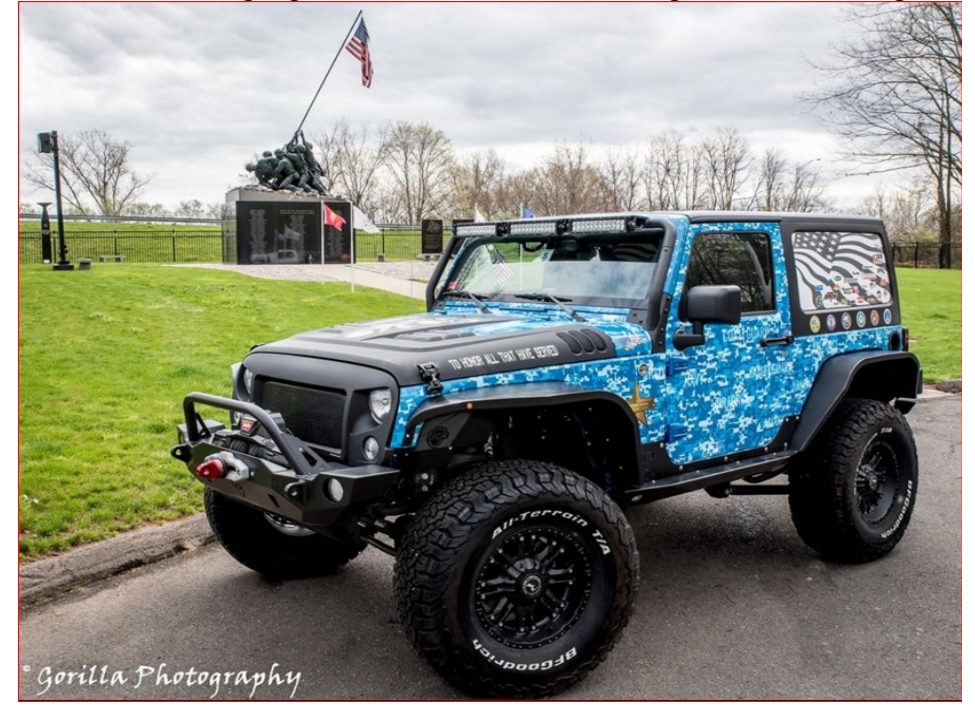
Folded Flag Tribute Jeep

The Great American Charitable Events Tribute Jeep build is done and starting its tour. Check out it's build progress and be sure to check it out at the Great American Jeep Rally. I'm happy and proud to say I had a small part in this build, one of hundreds of people who contributed in making this awesome rig a reality