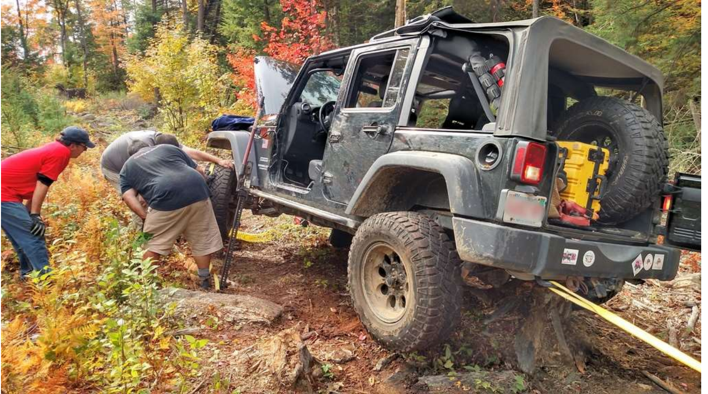
Jeep Camaraderie: helping others and having a helluva good time doing it