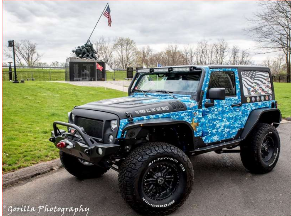
Folded Flag Tribute Jeep

The Great American Jeep Rally is the premier event of Great American Charitable Events (GACE). GACE is a registered non-profit organization that organizes events across the country and this years Jeep Rally did not disappoint! The largest, single-day Jeep event in the country benefited from perfect weather, a huge turnout and stronger than ever vendor support