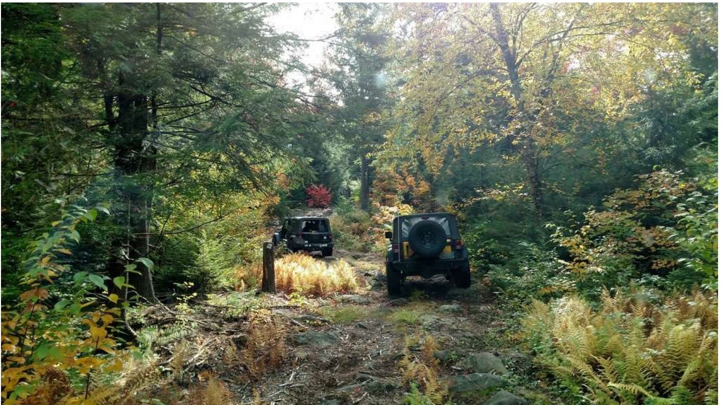
Early Fall in New England. It doesn't get any better than this