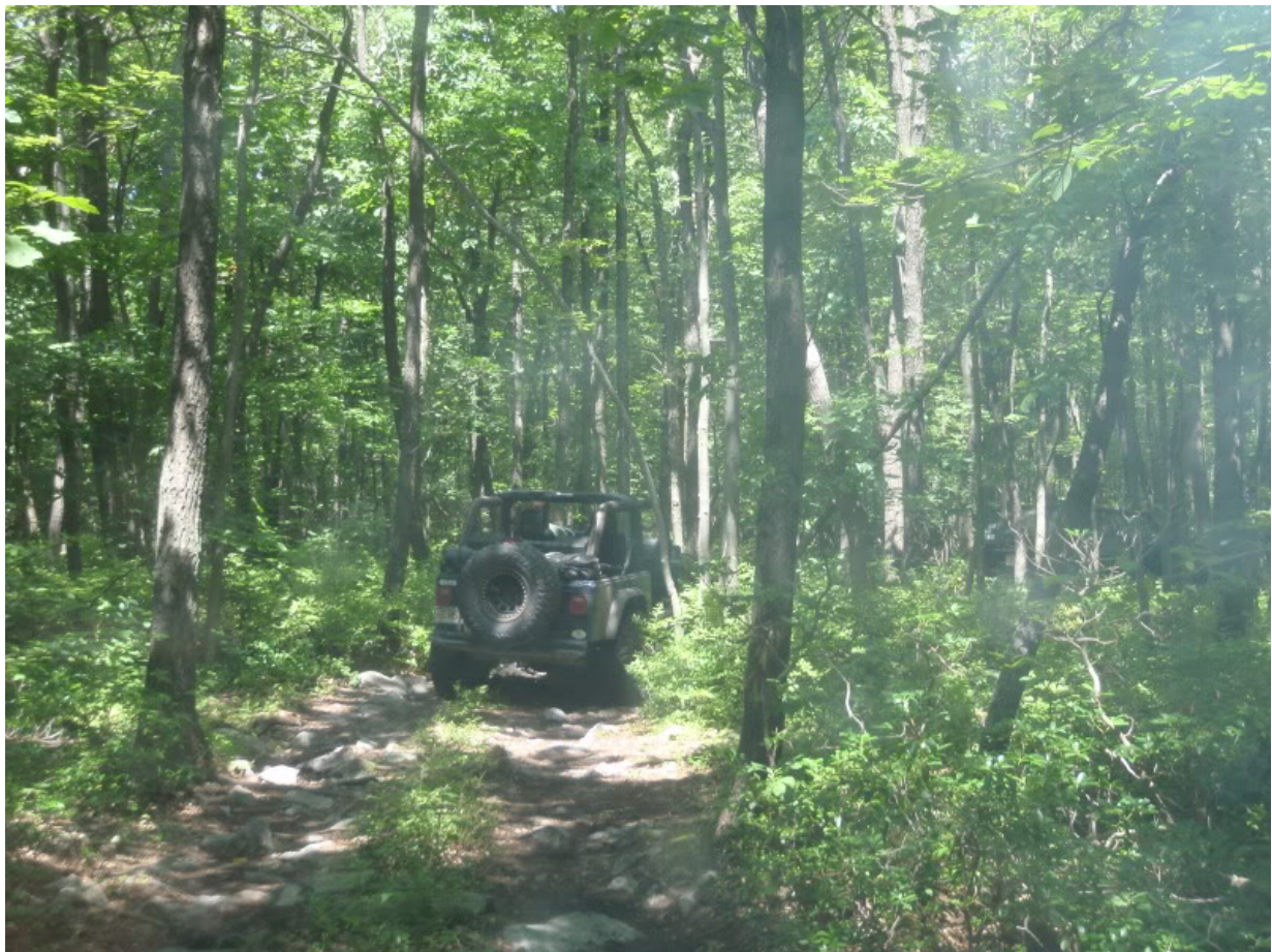
And don't forget - there are literally miles and miles of green and blue trails, for the more moderately built rigs (which is where I'll be spending most of my time)