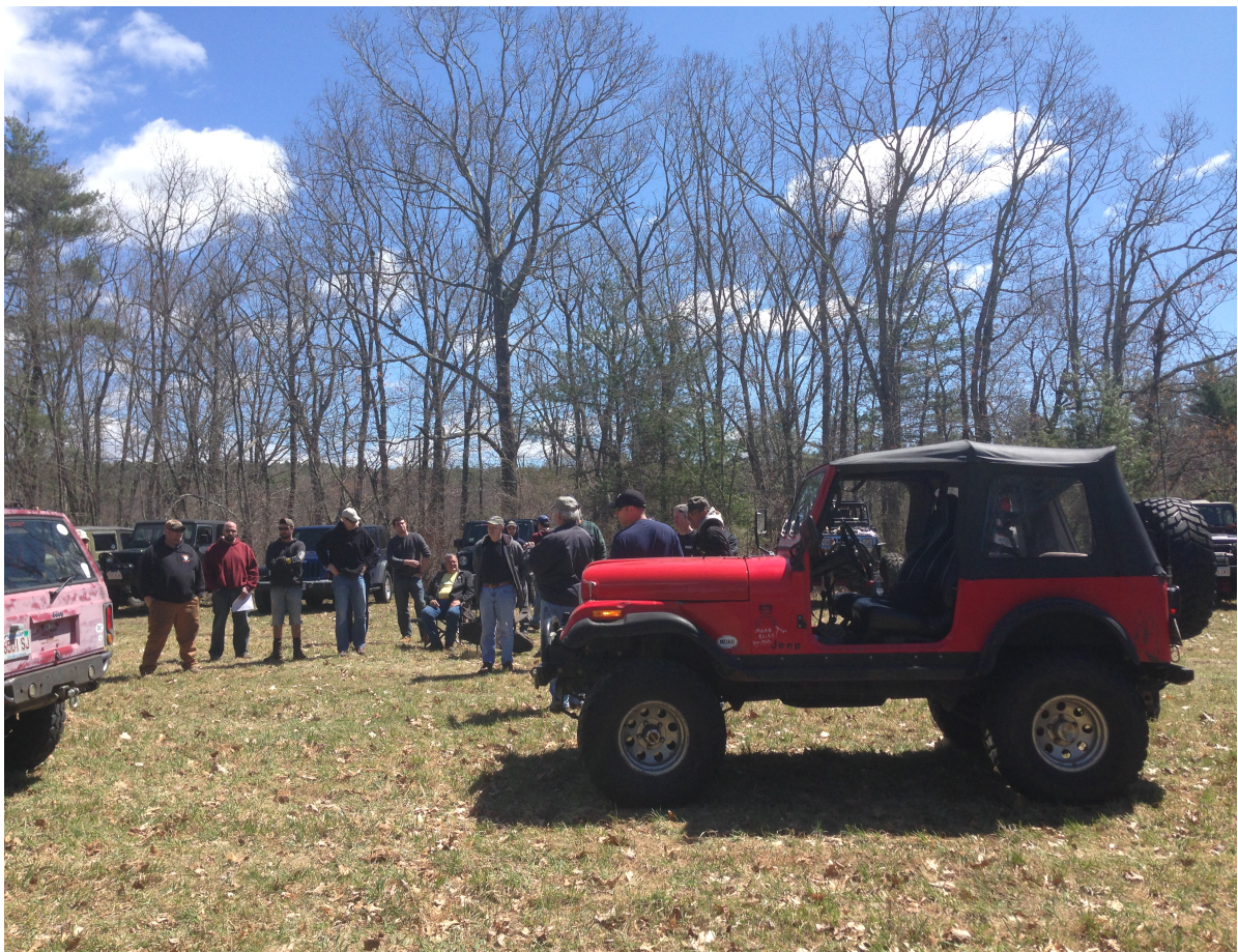
Last years weather was perfect, with a great turnout

A hugely popular event, this is held on private land and you must sign up for this event. The event is free but signing up is mandatory. Easy enough, go to Baystate Jeepers Jeep 101 and tell them you're interested