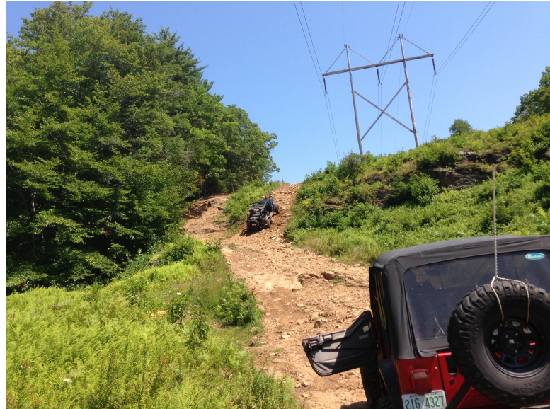
Pretty sure this is where Jay's rear diff grenaded