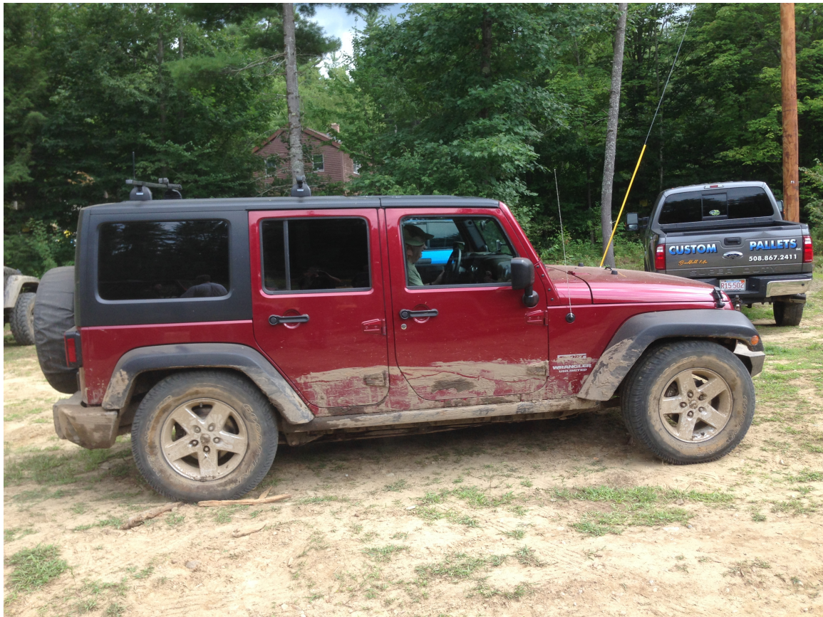
Even after cleaning up some mud, Ralph still had a reminder of how deep it was

Overheard on the CB while driving in the torrential downpours: