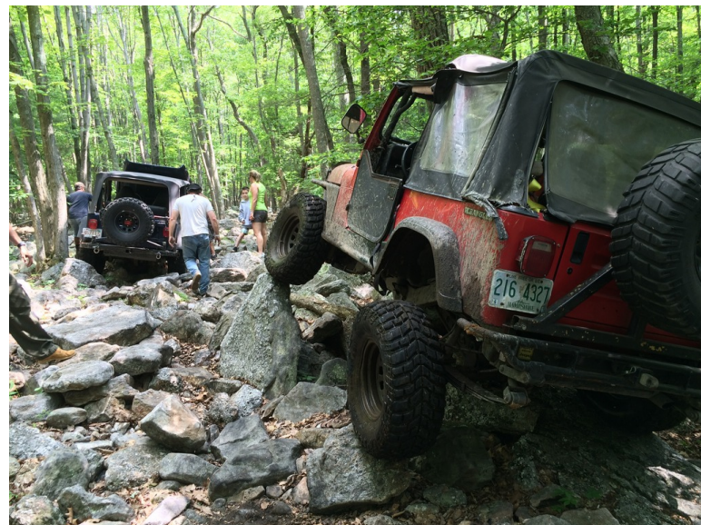
It's never a good sign when a hood is up, and never pass on a poser shot