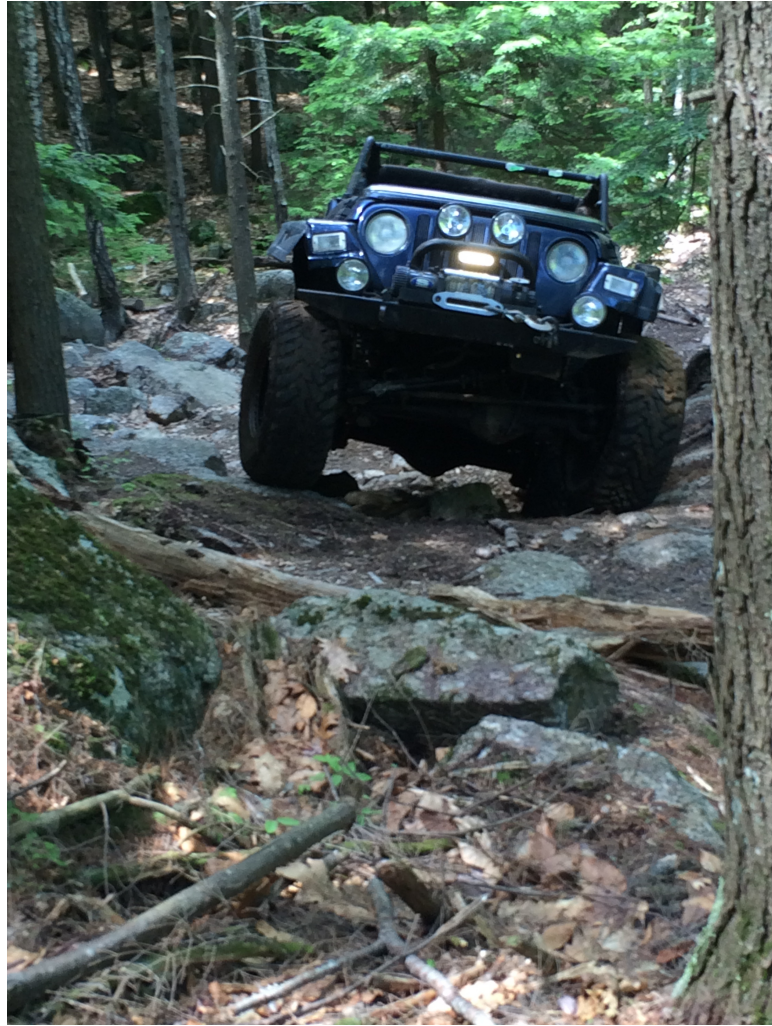
Ryan's LJ is always up for any challenge