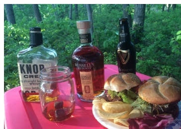
And when the day is done, NOBODY does it better than the BSJ crew