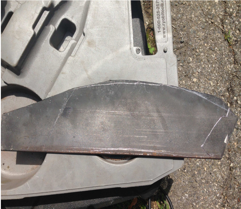
Rough cut of the patch

Next up, figure out the patch you need. A wise man once said to me, “if you can't cut it out of cardboard, how the hell do you expect to cut it out of metal?” Using cardboard, I cut a rough template. Next up was an angle grinder to cut some 1/4” steel. Yeah, it was a bitch. This is my first pass, the lines etched into the patch show what the final cut should look like