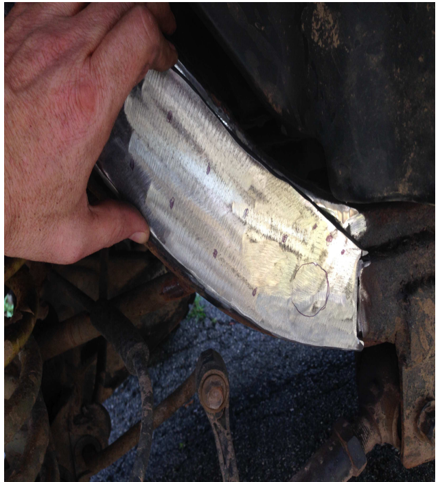
Final cut, and a test fit