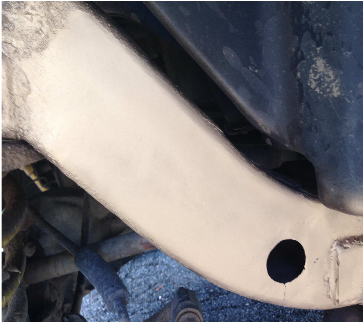
Multipelcoats of weld-thru primer covered the frame and welding areas