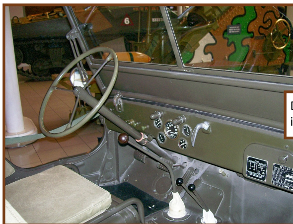
Dashboard of World War II era jeep in Imperial War Museum (2007)