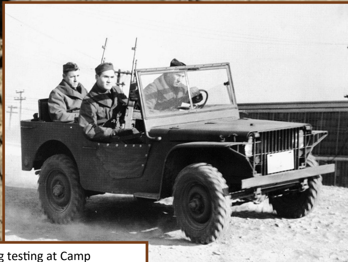
Ford Pygmy during testing at Camp Holabird, Maryland (c. 1940)