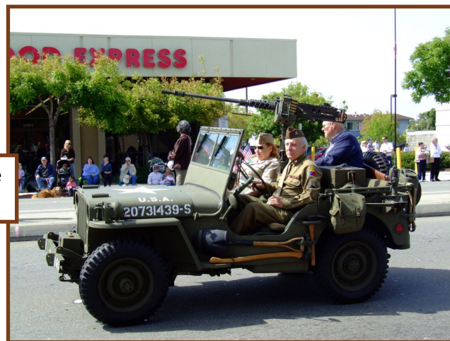
Jeep with 50 cal. Browning machine gun (2008)

Because the US War Department required a large number of vehicles in a short time, Willys-Overland granted the US Government a non-exclusive license to allow another company to manufacture vehicles using Willys' specifications. The Army chose Ford as a second supplier, building Jeeps to the Willys' design. Willys supplied Ford with a complete set of plans and specifications. [24] American Bantam, the creators of the first Jeep, built approximately 2,700 of them to the BRC-40 design, but spent the rest of the war building heavy-duty trailers for the Army.