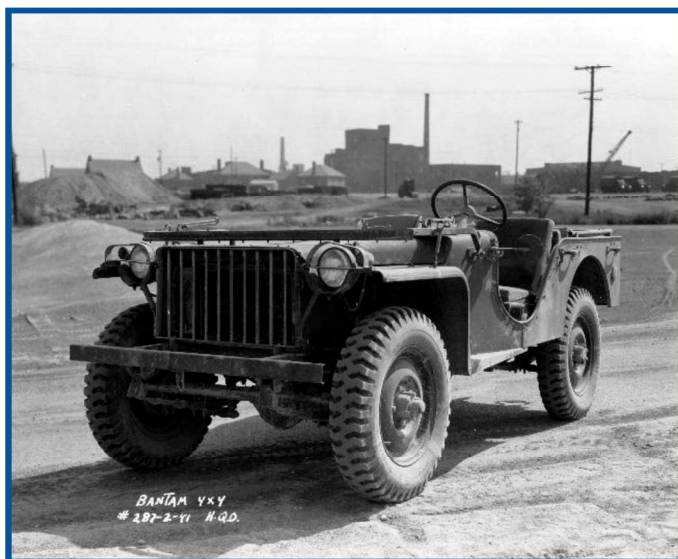
Bantam's BRC 40, pictured in 1941